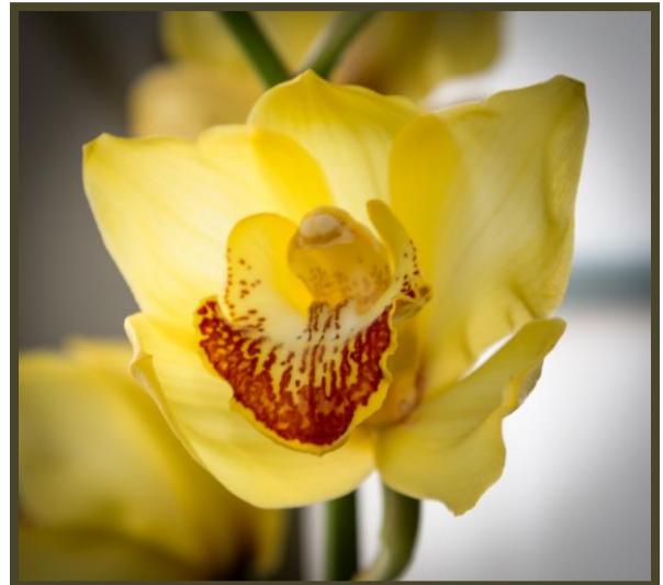
Below: Unknown cymbidium from Carter and Holmes