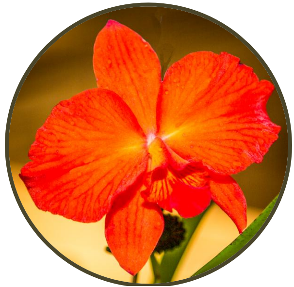
Above: Slc. Richard Stone purchased at SCOS Show from Carolina Orchids.

1/22 - 1/24 NC Piedmont Orchid Show Stowe Botanical Garden, Belmont, NC 2/12 - 2/14 SCOS Orchid Show Riverbanks Botanical Garden, Columbia SC 3/4 - 3/6 Triad Orchid Soc. Show Greensboro Council of Garden Clubs 4/14-4/17 AOS Spring Members Mtg. and Western NC Show Asheville NC NC Arboretum and Asheville Biltmore Park