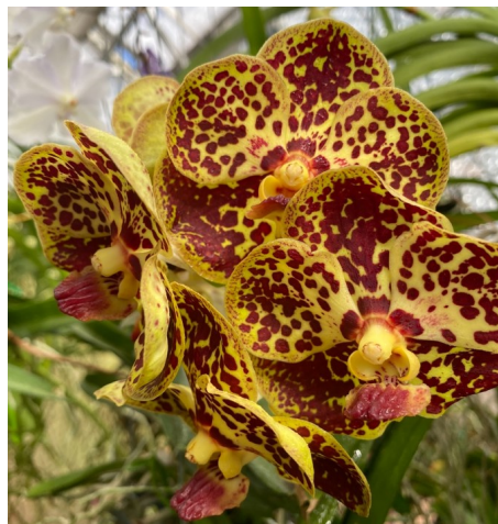
Below: Vanda Painters Dream x Kulwadee Fragrance