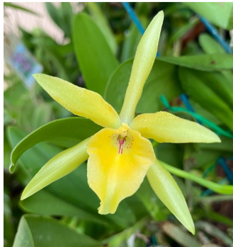
Above: Cattleya Daffodil