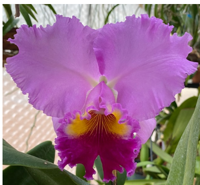
Above: Lc. Drumbeat Heritage