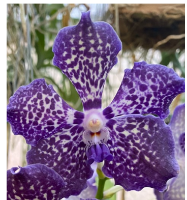
Below: Vanda Mimi Palmer x Gordon Dillon