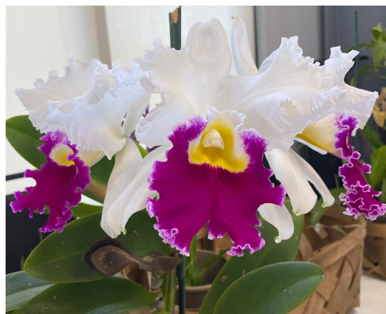
Below: Lynn Macleod & Motes Absorbs