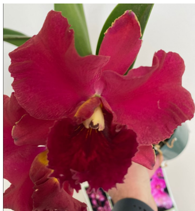
Above: Blc. Rugeley's Mill 'Mendenhall' HCC/AOS