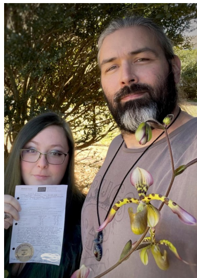
Above: Recently Awarded Paphiopedilum haynaldianum 'Karen Resh' AM/AOS