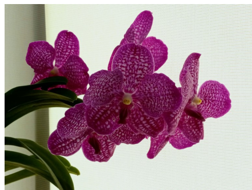
Vanda Noppadol Delight