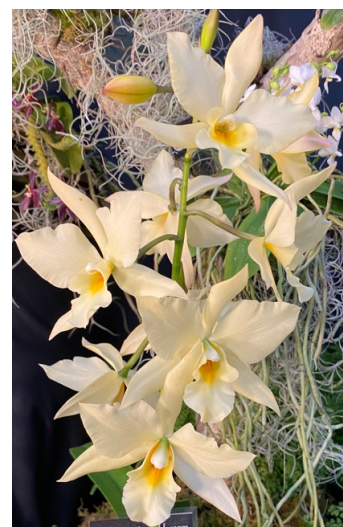
Above: Iwanagara Apple Blossom 'Lemon Pie' AM/AOS