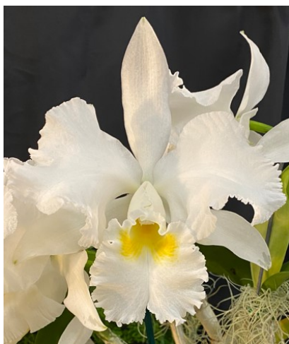
Above: Cattleya Elizabeth Carlson 'Linwood'

ESTABLISHED 1964 AN AFFILIATE OF THE AMERICAN ORCHID SOCIETY