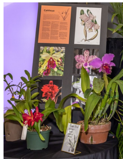
Cattleya Education Station at SCOS Show