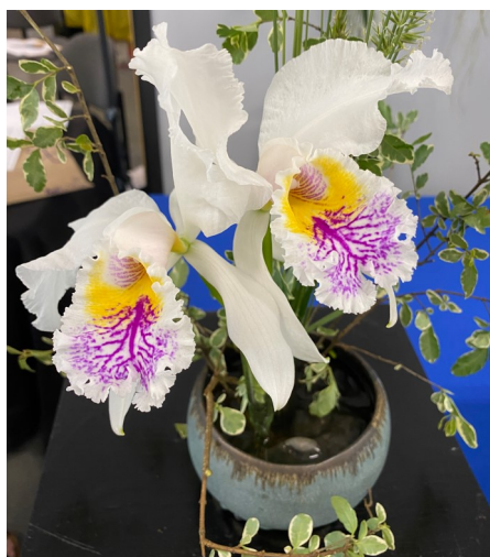
Above: Ikebana display at the SCOS Show