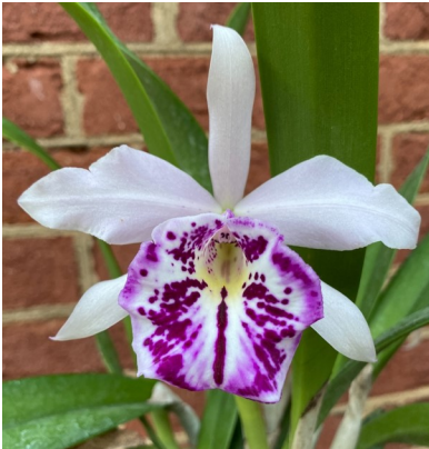
Blc. Taiwan Big Lip