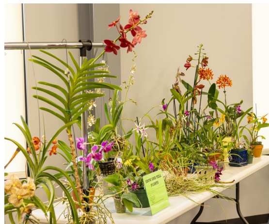
Above: August Show & Tell Table