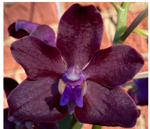
Vanda Motes Wise Women