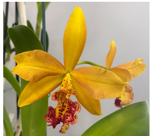
Above: Blc. Copper Queen