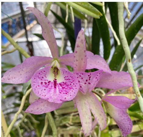
Above: Brassocattleya Maikai