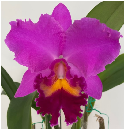
C. Myrtle Beach x Lc. Drumbeat (C&H 6182)