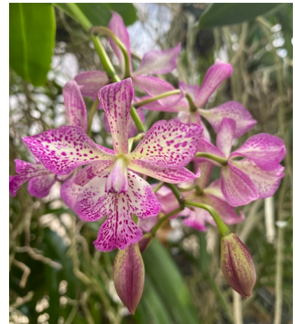
Epicatarthron Hilo Adventure