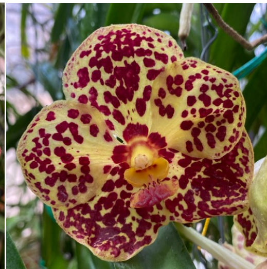
Above: Vanda Painter's Dream x Kuwaldee Fragrance