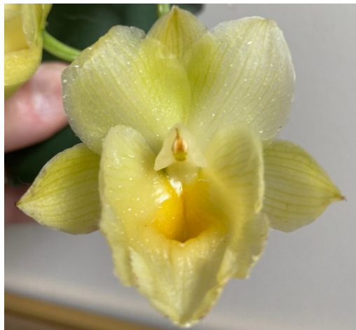
Above: Clowesetum Amazing Grace