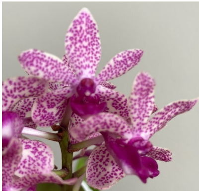
Ascofinetia AF Buckman 'Classic Pink Clouds' x Rhynochostylis gigantea var rubrum