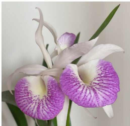
Above: Blc. Yu Toung Star 'Big Tonge'