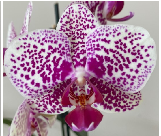
Above: Phalaenopsis Long Pride Fancy