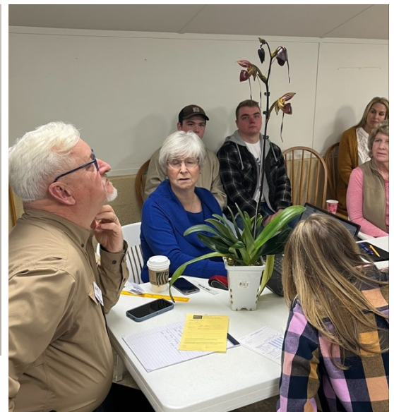
Above: AOS Judging@ Carter & Homes