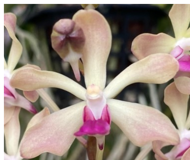
Above: Vandachostylis Jim Solly x Vanda Motes Ruby