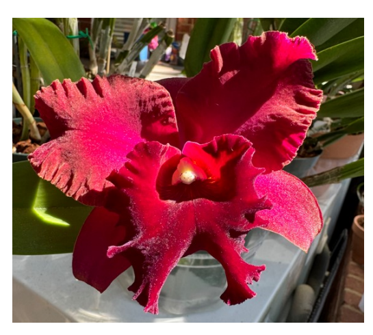
Above: Blc. Rugeley's Mill 'Mendenhall'

Awaiting venmo $653.50 Auction Proceeds $633.50 Membership (1) $20.00