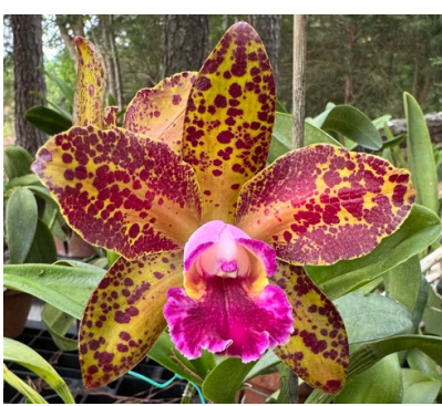
Above: Waianae Leopard