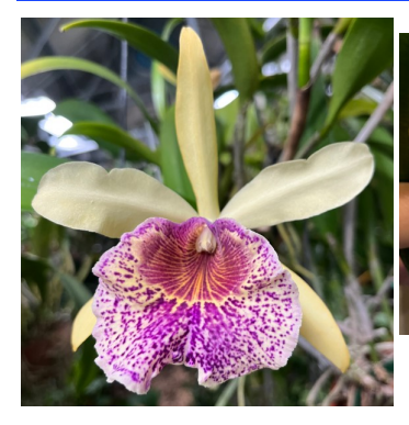
Above: Blc. Keowee 'Mendenhall 'AM/AOS