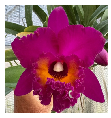
Rlc. Hawaiian Rubu