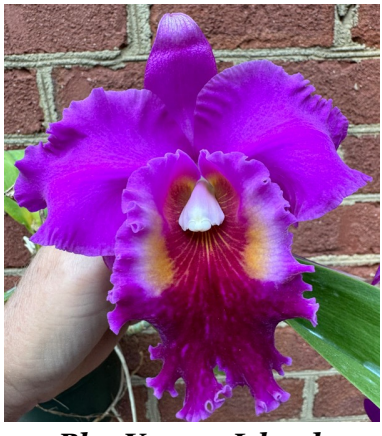
Blc. Yonges Island x James Island

ESTABLISHED 1964 AN AFFILIATE OF THE AMERICAN ORCHID SOCIETY