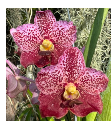
Above: V. Motes Arabesque x V. Motes Mandarin