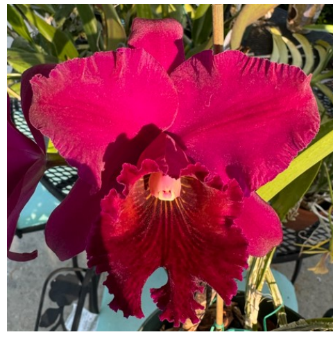
Above: Blc. Edisto 'Carol'