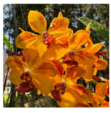
Above: Vanda Ploenpit Prize