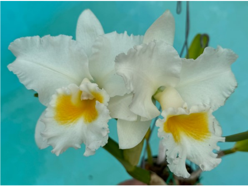
Above: A beauty purchased at the recent Carter & Holmes Open House—9978 Bc. Anita Gleroc 'Pink Classic' x Bc. Anita Gleroc 'Newberry'