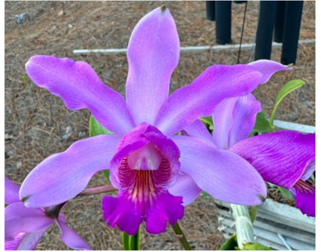
Above: Myrmecocattleya Tiffany's Tiarra