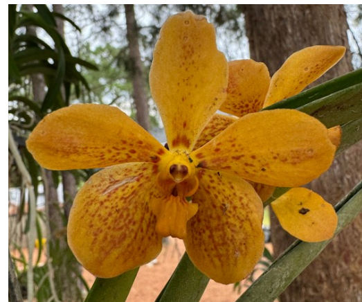
Above: Vanda Miami Mandarin x Vanda Fulford's Gold