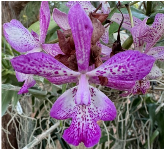
Above: Epicatarthron Hilo Adventure