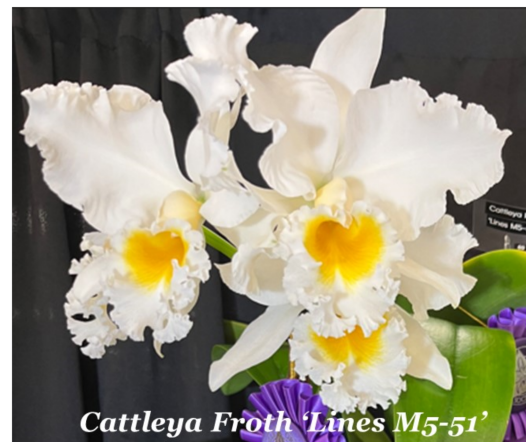
Cattleya Froth 'Lines M5-51'