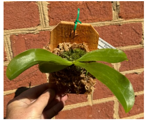
Above: a newly mounted Phalaenopsis Meen Estrella