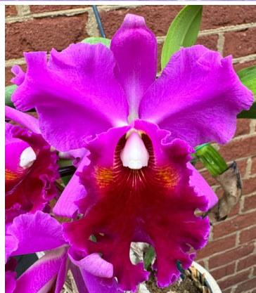
Rlc. Crispin Rosales 'Sandra Spearman' AM/AOS