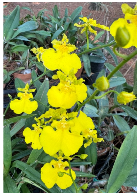
Above: Oncidella Lemon Heart