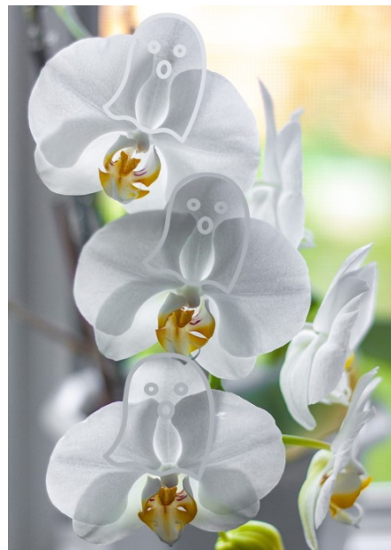
Above: Phalaenopsis Casper