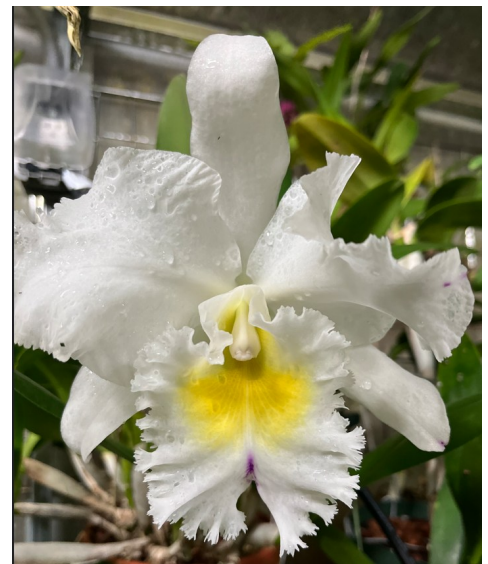
Above: Bc. Pastoral 'Innocence'