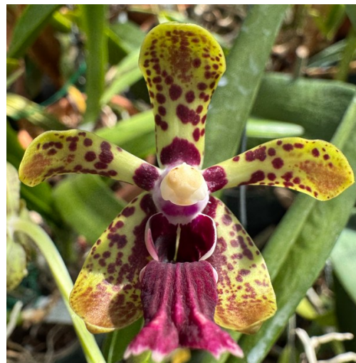
Above: Vanda Alice Motes x Vanda Cristata