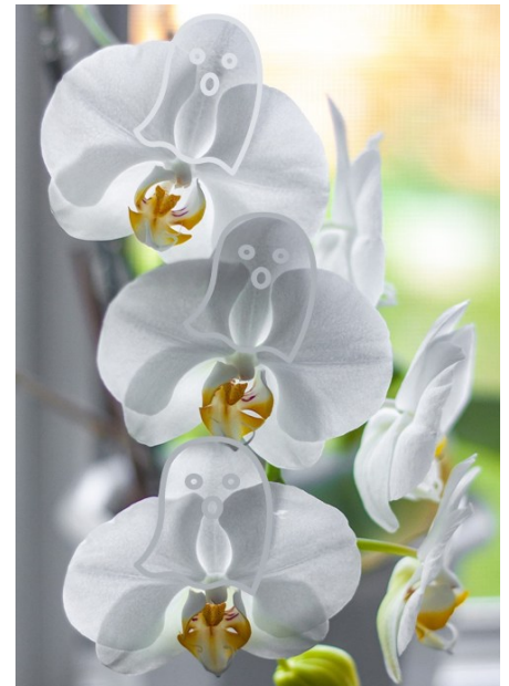
No one commented on this special Phalaenopsis Casper from the October Newsletter! Maybe you were too scared!