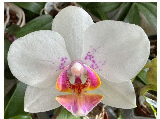
Above: Phalaenopsis Porcelain Doll 'Mendenhall'