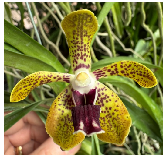
Above: Vanda Alice Motes x Vanda Cristata

Both first time blooms. Which one do you like best?