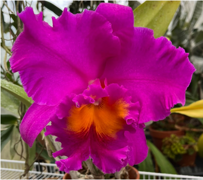
Rlc. Volcano Empress 'Volcano Queen'