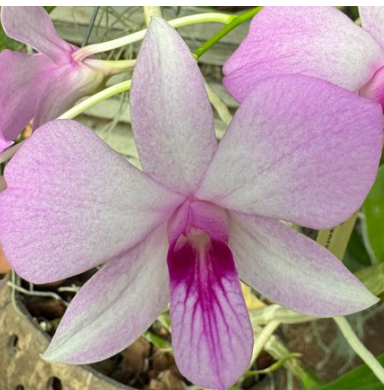
Dendrobium striaenopsis Moluccas Indonesia