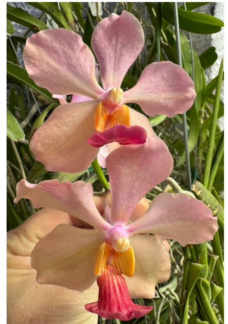
Above: Papilionanda XiShan Midful 85