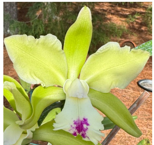
Blc. Green Goddess