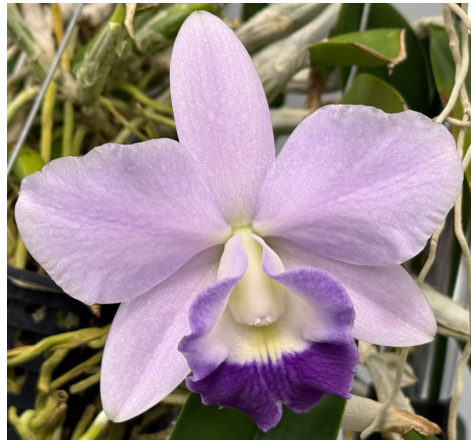
Above: Cattleya Mini Purple