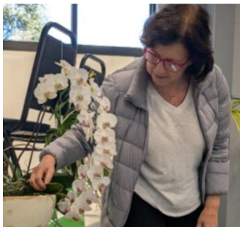
Above: Visitor with long arching Phalaenopsis @ show and Tell