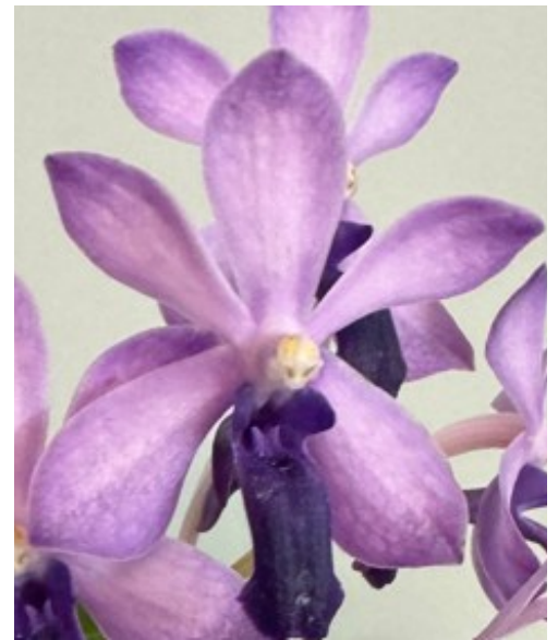
Above: Vascostylis Thailand x Ascofinetia Lou Sneary