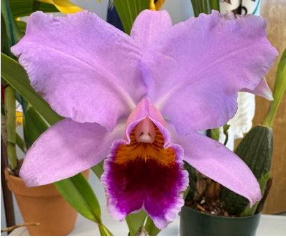
C. percivaliana 'Meril' AM/AOS