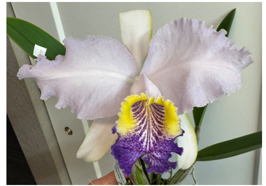
C. lueddemanniana var. coerulea