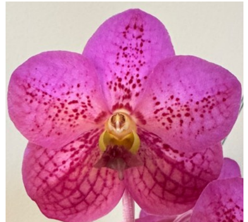
Above: Vanda My EmiLu