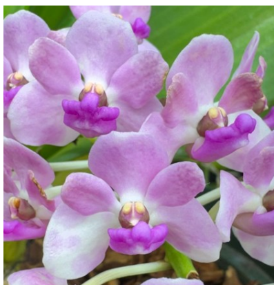
Above: Rhy. Gigantea Pink

New Time —Based on feedback, we are adjusting the starting time to 1:00 PM. This is to give everyone more time for morning tasks, and time before the meeting starts to enjoy snacks, socialize, and examine the show & tell, and raffle plants.