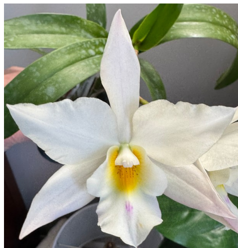
Above: Iwan. Apple Blossom