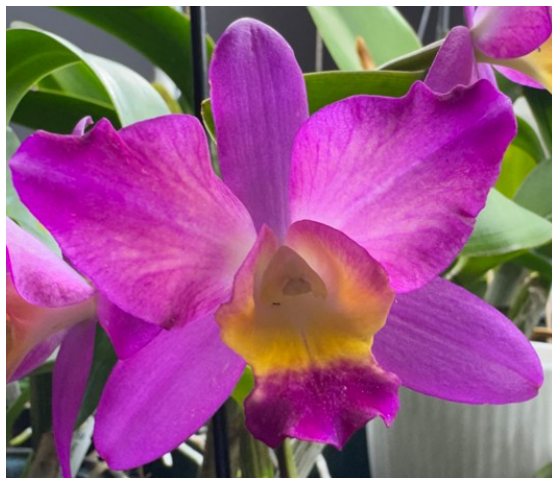
Above: Ctt. Orchidglade 'SVO' HCC/AOS x C. Angel Eyes 'SVO' AM/AOS

Also check out our Facebook and In- stagram pages