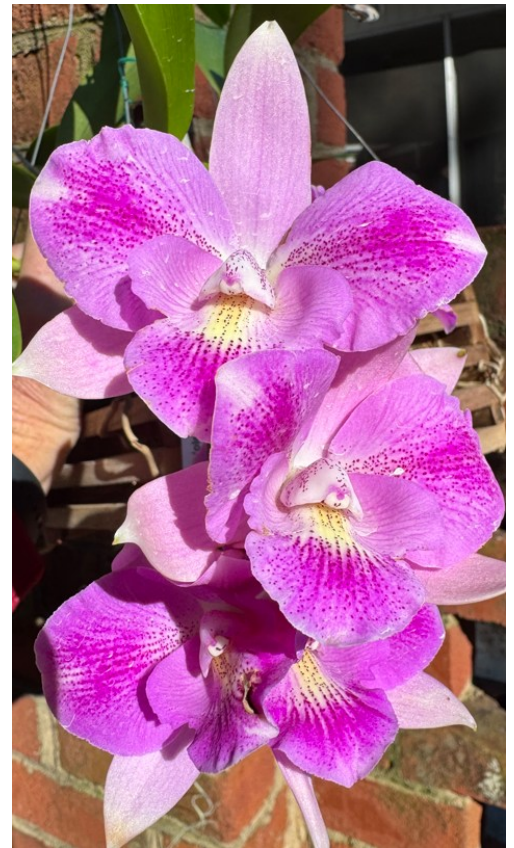
Above: Dialaeliocattlya Newberry Pink Splash

We also want to have a field trip to Looking Glass Orchids and Owens Orchids late summer/early fall