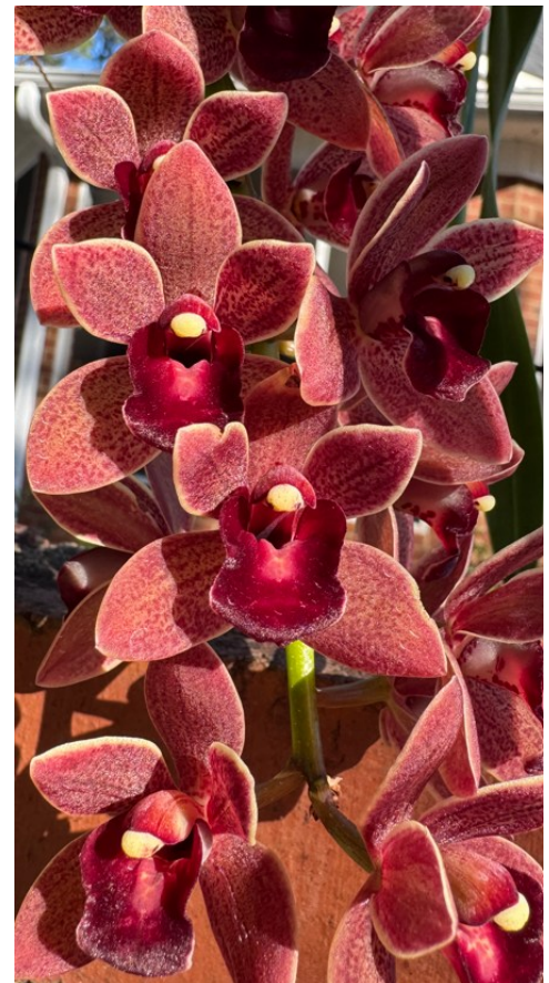
Above: Cymbidium Dorothy Stocksill