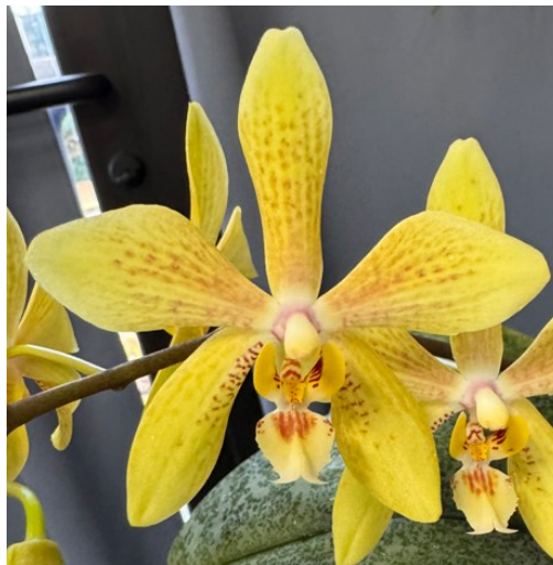
Above: Phalaenopsis Manniphil