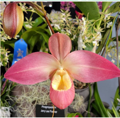
Phragmipedium Jerry Lee Fischer

ESTABLISHED 1964 AN AFFILIATE OF THE AMERICAN ORCHID SOCIETY