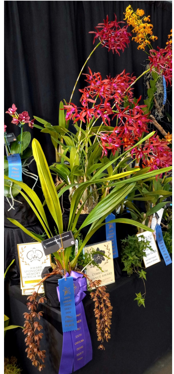
Above: Laeliocatanthe Newberry Lava Burst and Cymbidium Marble Branch Farms