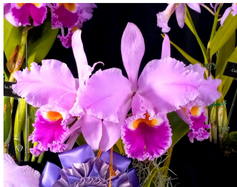
Cattleya John Mossman